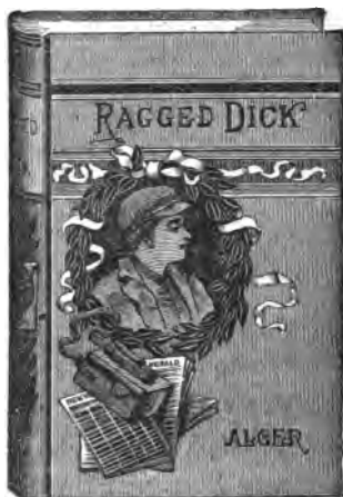
Specimen Cover of the Ragged Dick Series.

Horatio Alger, Jr., has attained distinction as one of the most popular writers of books for boys, and the following list comprises all of his best books.