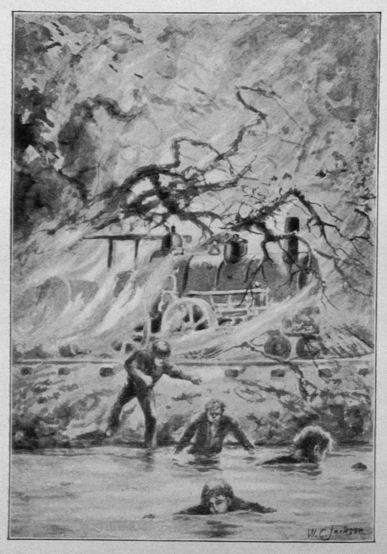
A Dash for the Lake.